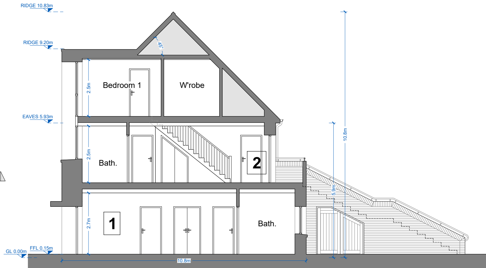
SECTION AA SCALE 1:100